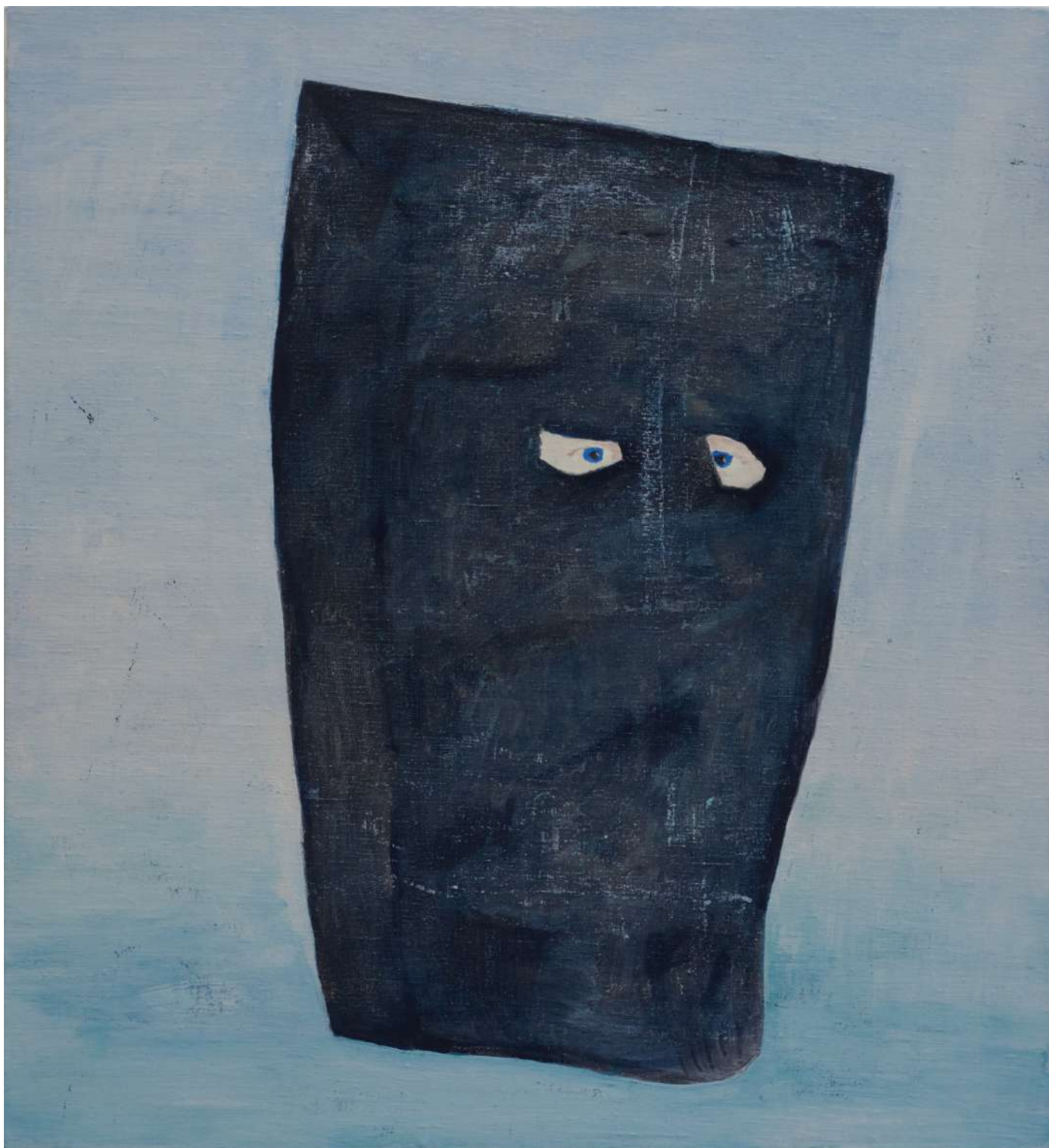
HEAD IN A BOX Óleo sobre lienzo 61x56 cm 2017