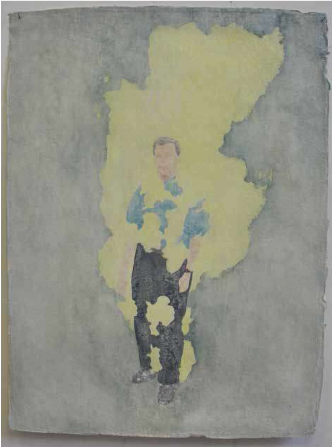
HE KEPT ME WARM ALL NIGHT