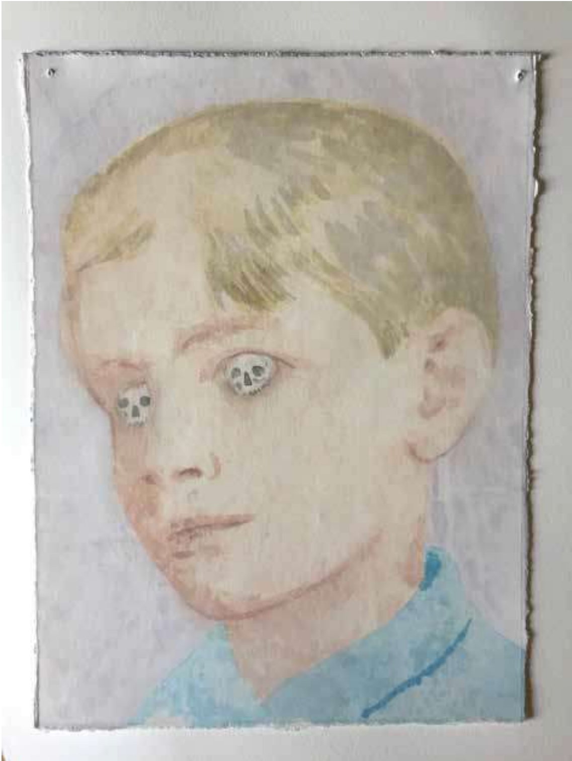
REGARDING THE PAIN OF OTHERS Acuarela sobre papel (Enmarcado) 38x28 cm 2016