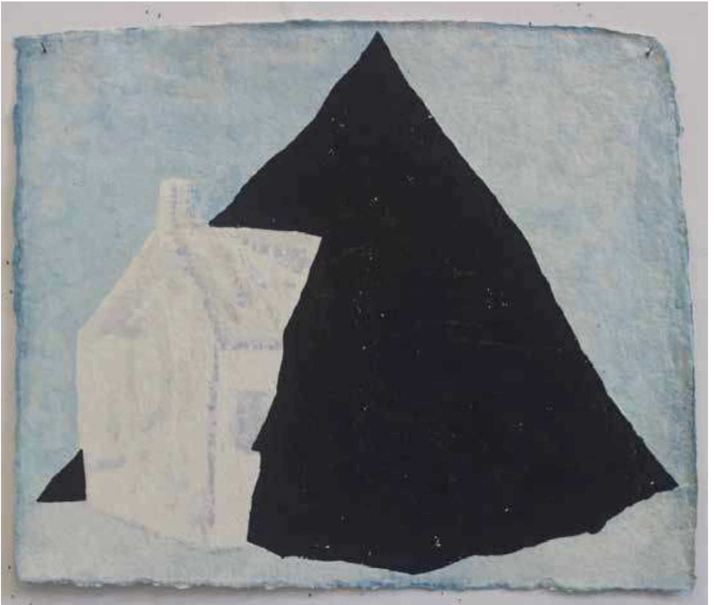
HOLD ME TIGHT AND NEVER LET ME GO Acuarela sobre papel (Enmarcado) 38,5X46 cm 2016