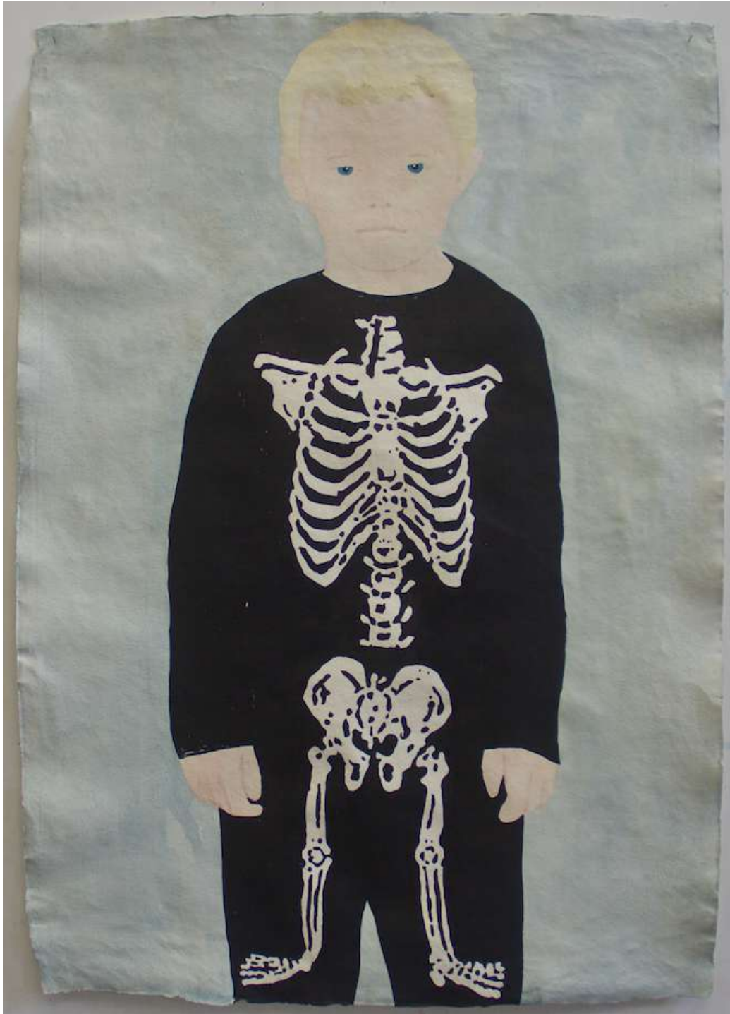
BOY WITH BONES Acuarela sobre papel 131X93 cm 2004