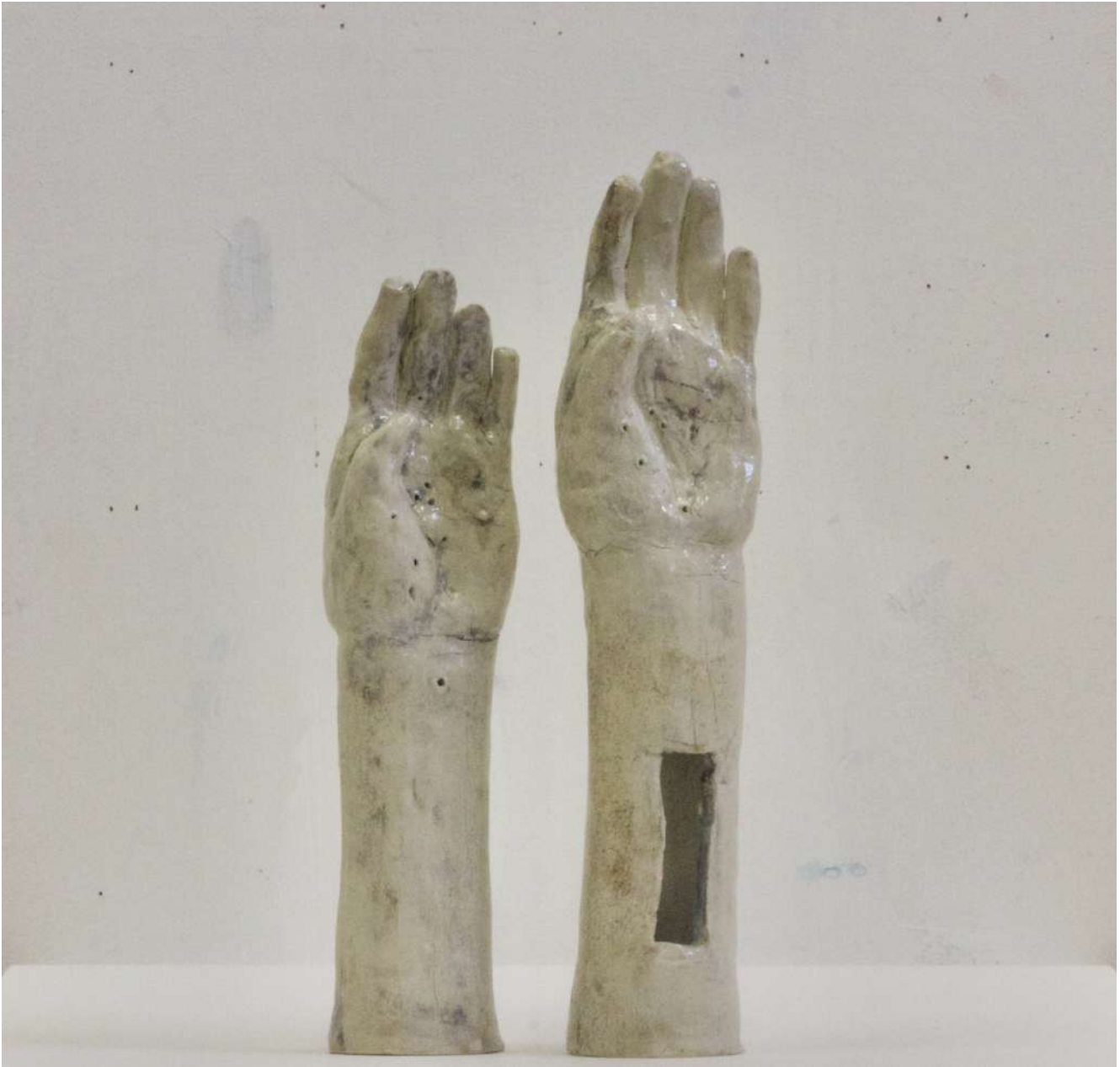
LEFT HAND ONE / LEFT HAND TWO Ceramic