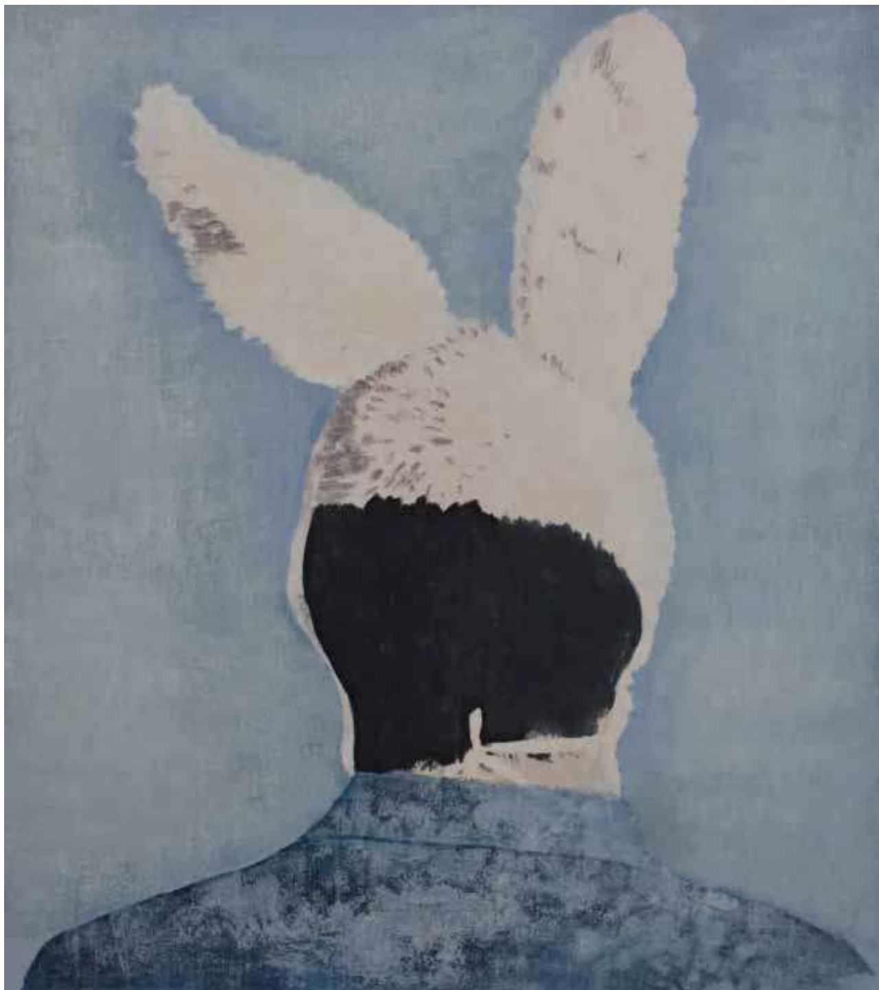
I M A RABBIT Óleo sobre lienzo 92X81 cm 2016