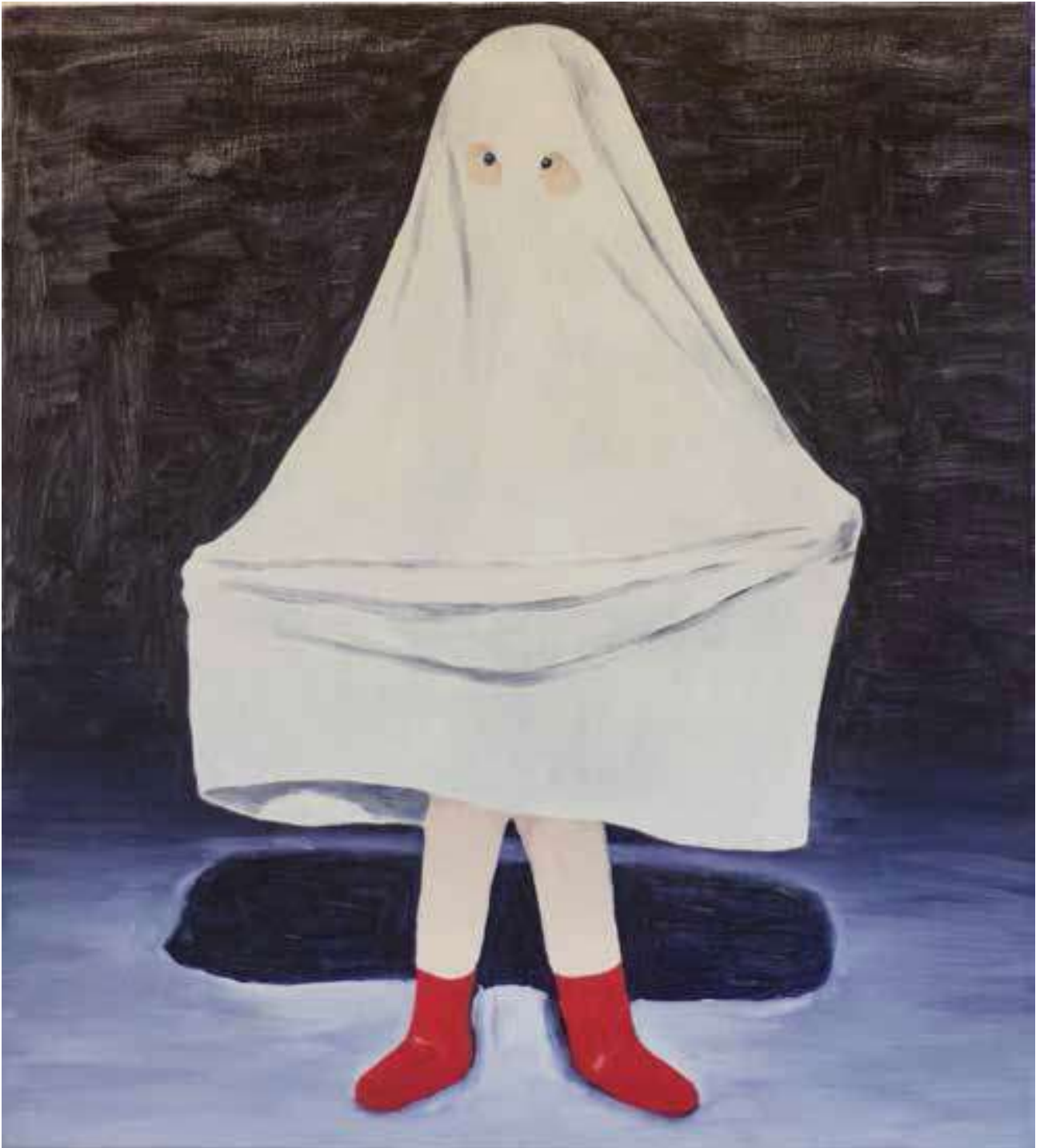
GHOST WITH RED SOCKS