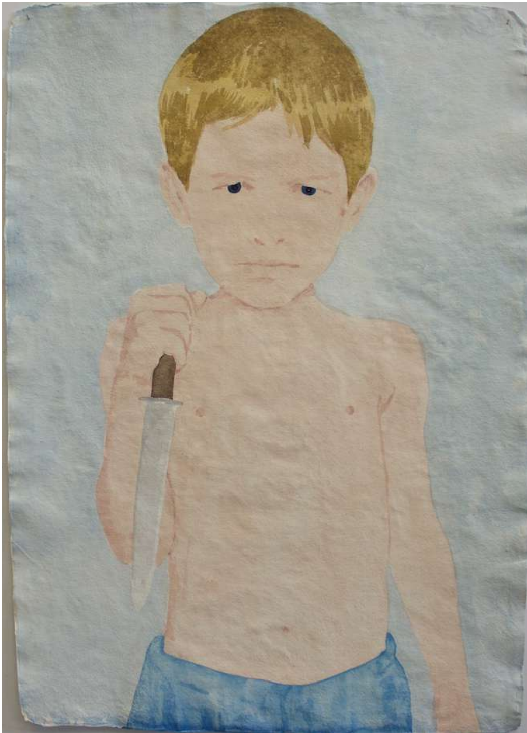
BOY WITH KNIFE Acuarela sobre papel 131X93 cm 2004